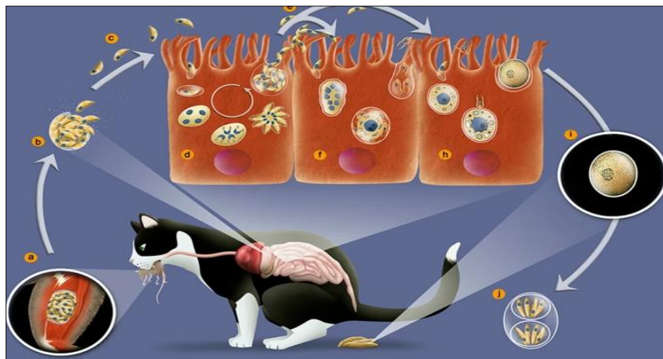
Fig 2: Mode of transmission in the epidemiology of T. gondii infection (Attias et al. , 2020).

T. gondii infection was found to have an age-related seroprevalence of 15.8% (Knoll et al. , 2019) [30]. However, approximately 85% of women of reproductive age are seronegative and are at risk of contracting T. gondii infection during pregnancy. Additionally, rates of congenital toxoplasmosis are estimated to range from 1 to 10 per 10,000 live births (Yan et al. , 2016) [53]. However, approximately 85% of women of reproductive age are seronegative and are at risk of contracting T. gondii infection during pregnancy. Additionally, rates of congenital toxoplasmosis are estimated to be between 1 and 10 per 10,000 live births (Elmore et al. , 2010) [16].